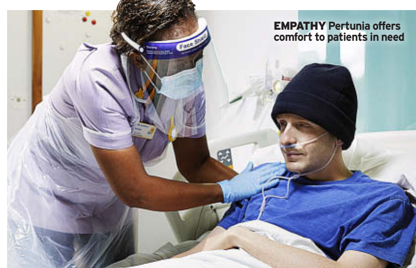
EMPATHY Pertunia offers comfort to patients in need